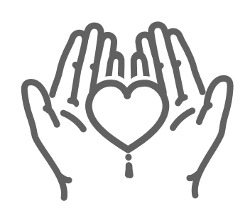
30,647 Volunteer Hours