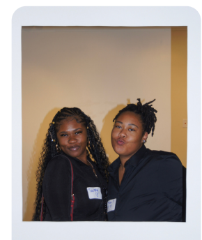
Chattanooga Community Kitchen homelesschattanoogaorg